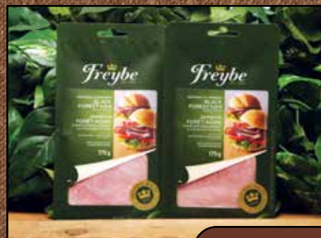
Freybe Sliced Meat Select Varieties 175 g.