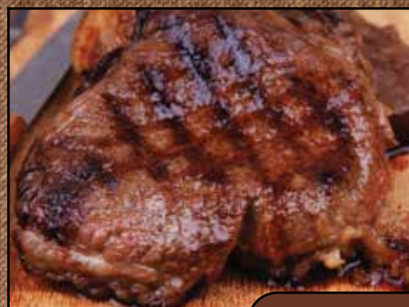
Sirloin Tip Marinating Steak kg. 17.59