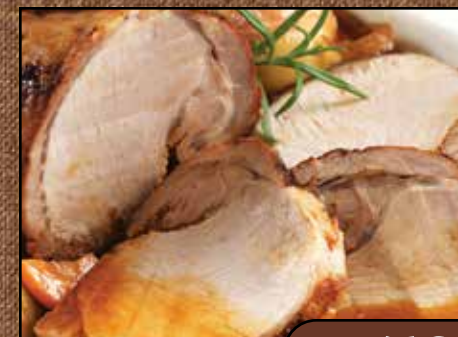
Centre Cut Pork Loin Roast kg. 7.67