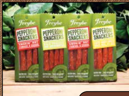
Freybe Pepperoni Snackers Select Varieties 125 g.