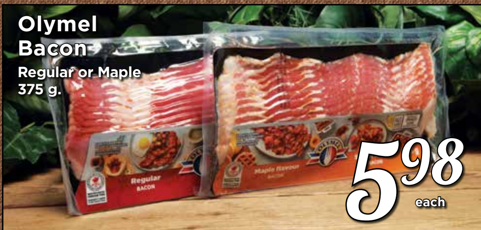
Olymel Bacon Regular or Maple 375 g.