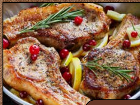
Centre Cut Pork Loin Chops kg. 8.77