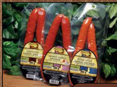
Harvest Sausage Rings Select Varieties 300 g.