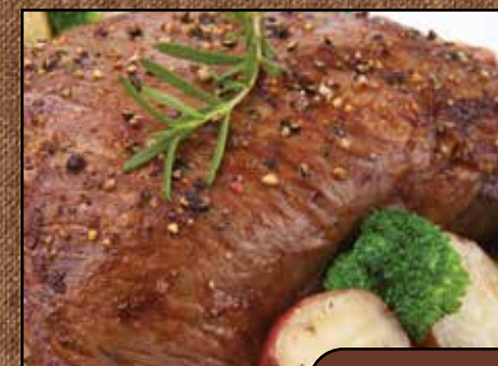
Sirloin Tip Oven Roast kg. 16.49