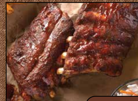
Pork Back Ribs kg. 10.98